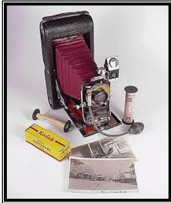
(Kodak No. 3 Folding Pocket Camera)

These were called "Real Photo Post Cards" or RPPCs. During this era, common man made their own personal postcards, usually using themselves or their property as the subject. It wasn't like sending a letter because you could only send your picture and a small message, sort of like sending a text, Tweet, or using Instagram today. Boy, times have sure changed . . . or have they?