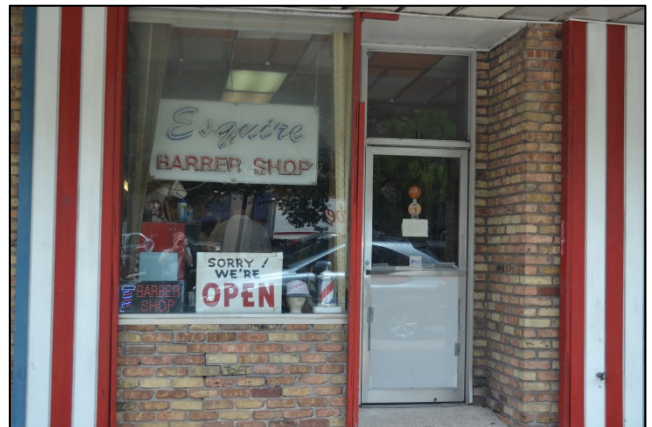
Esquire Barber Shop, 11 E. Garden St. Pensacola, Florida

As of January 2018, there is still an operating barber shop on the same premises, although under different ownership. The address is now 11, rather than 7 E. Garden, and the change is probably due to once larger premises coming before number 7 being subdivided into smaller ones, thereby upping the barber shop's address from number 7 to number 11. Its name is now Esquire Barber Shop whose