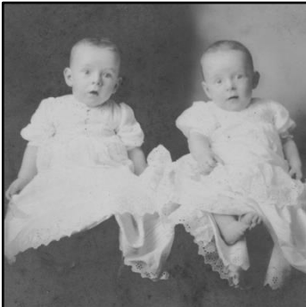
The twins at four months and three years of age.