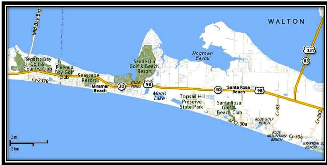
(Modern map of part of Destin and the Beaches of South Walton County)

M iramar Beach is just an extension of Destin, Florida, or so it seems today. As we ride through Destin on US Highway 98, we pass Destin Commons and approach the sign that we are entering Walton County. Destin seems to just continue on with more shopping centers, high-rise condos, golf courses, resorts and residential areas. Some of us notice that we are entering the unincorporated area called Miramar Beach, but it seems that busy Destin, Florida, just continues on into Walton County.