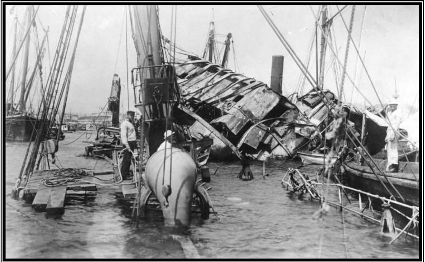
(Wreckage of the USS Maine [ARC-1] in the harbor at Havana, Cuba)

One of the first American battleships, the Maine , weighed more than 6,000 tons and was built at a cost of more than $2,000,000. The USS Maine had been sent to protect U.S. citizens and property after rioting in Havana. Spain announced an armistice on April 9, 1898, and granted Cuba limited powers of self-government. The U.S. Congress soon afterward issued resolutions that declared Cuba's right to independence, demanded the withdrawal of Spain's armed forces from the island, and authorized the President's use of force to secure that withdrawal while renouncing any U.S. design for annexing Cuba. 26