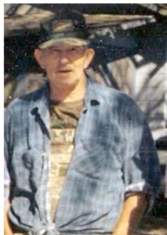
W.C., ages 14 & age 64